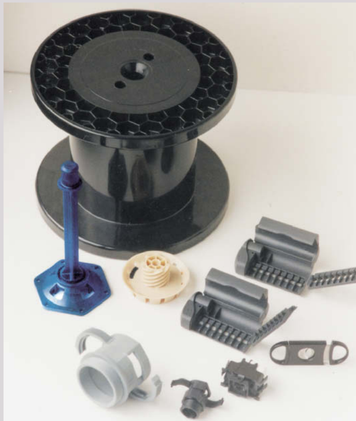
Products developed through cooperative efforts between customers and our application technology department.

To support your needs we run our own Applications Technology Department , which always stays at the leading edge of developments, thanks in great part to our partnership with the large plastics manufacturers. At the same time our high-tech testing laboratory ensures that customer requirements are met optimally and that consistent quality is guaranteed.